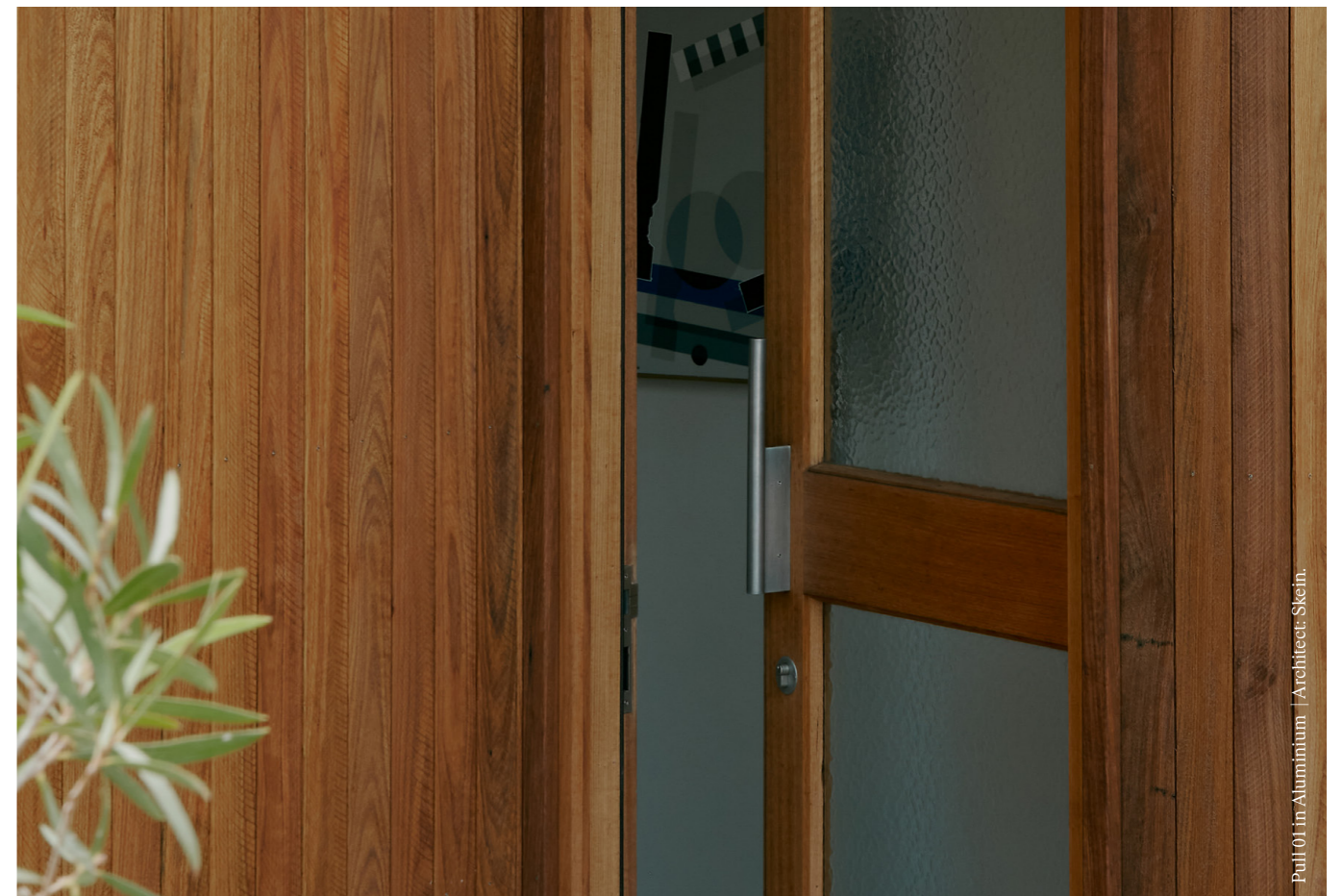
Pull 01 in Aluminium | Architect: Skein.