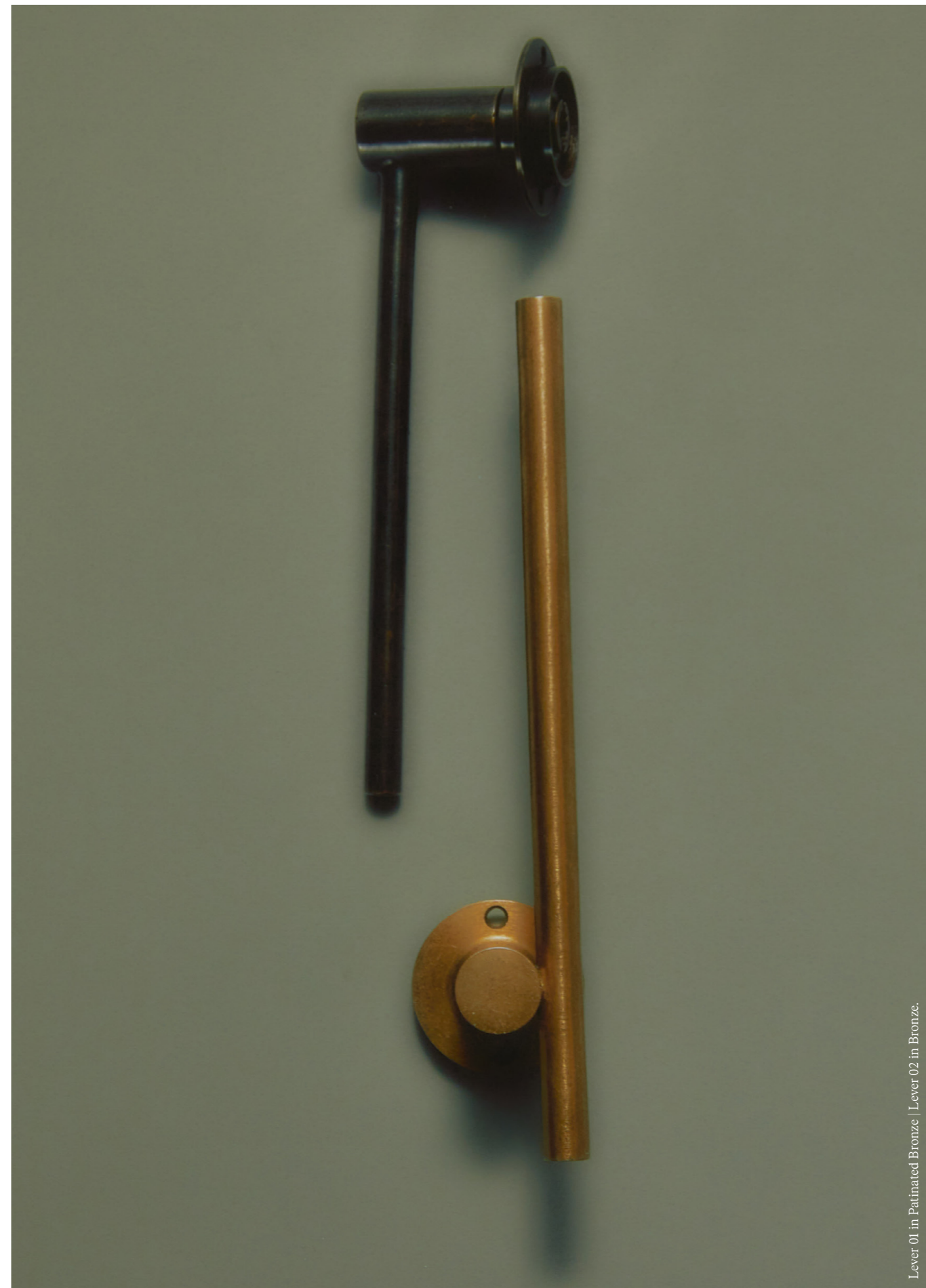
Lever 01 in Patinated Bronze | Lever 02 in Bronze.