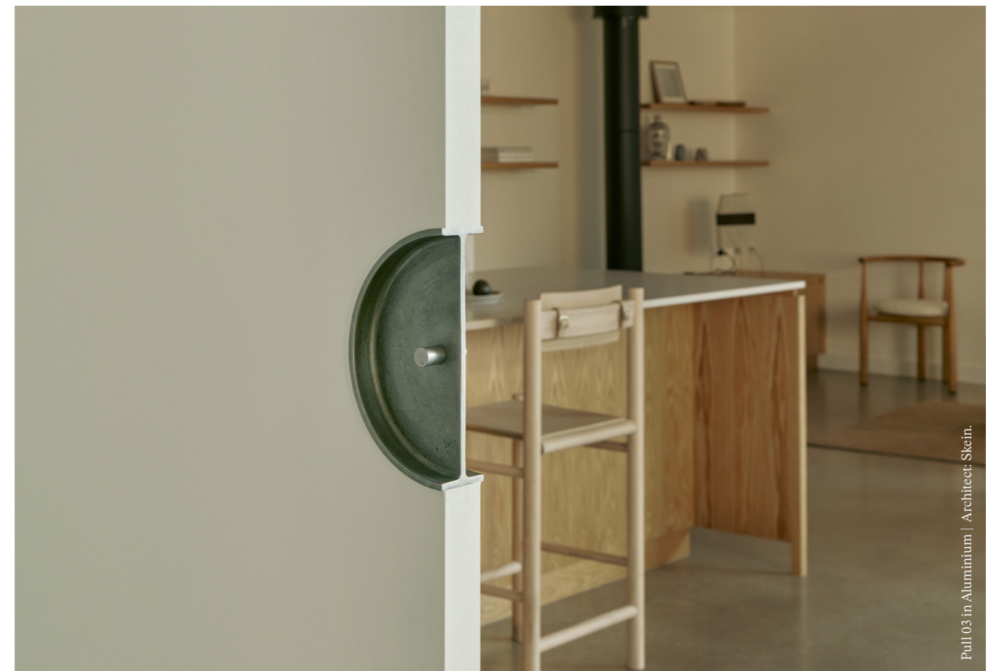
Pull 03 in Aluminium | Architect: Skein.