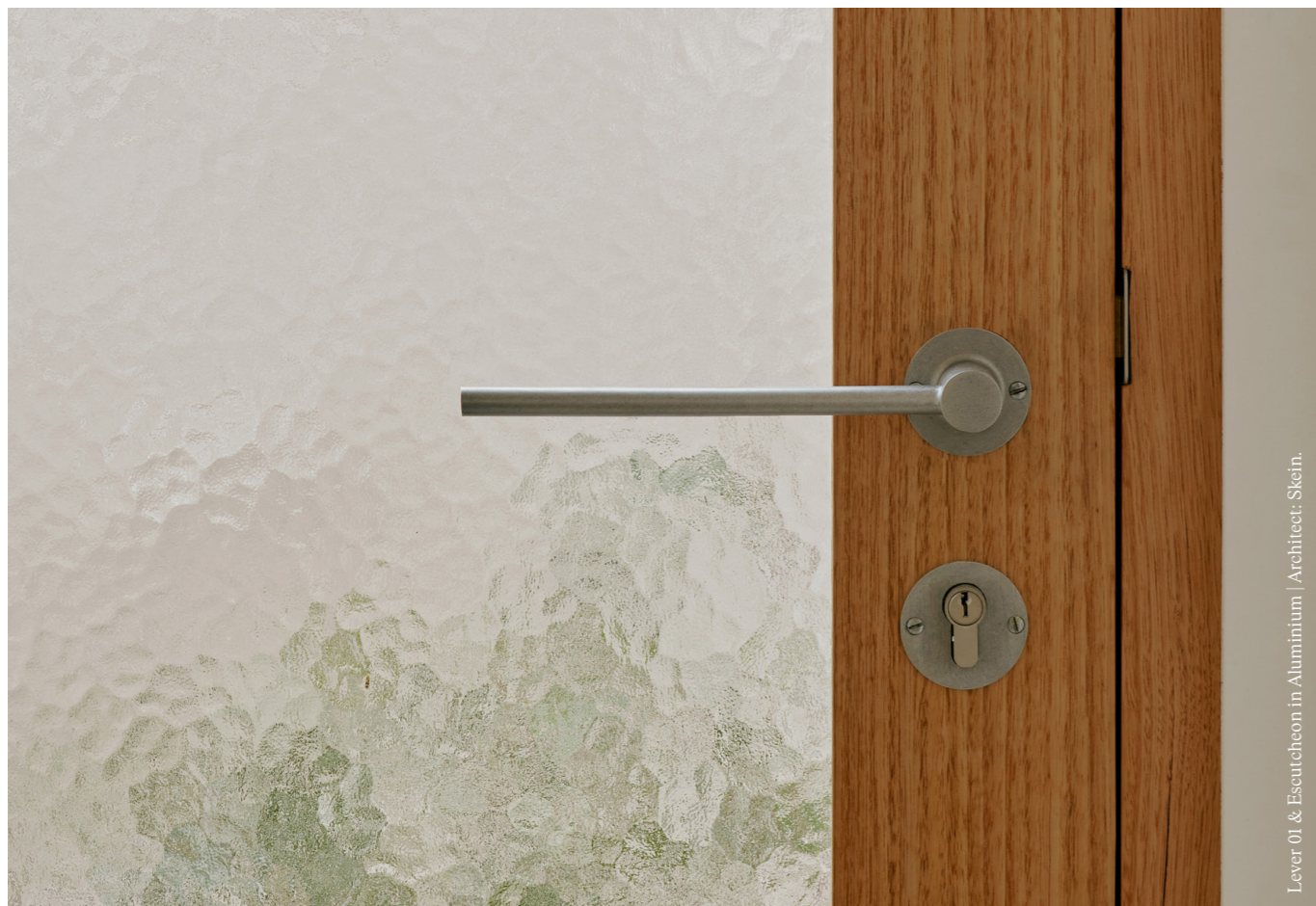
Lever 01 & Escutcheon in Aluminium | Architect: Skein.