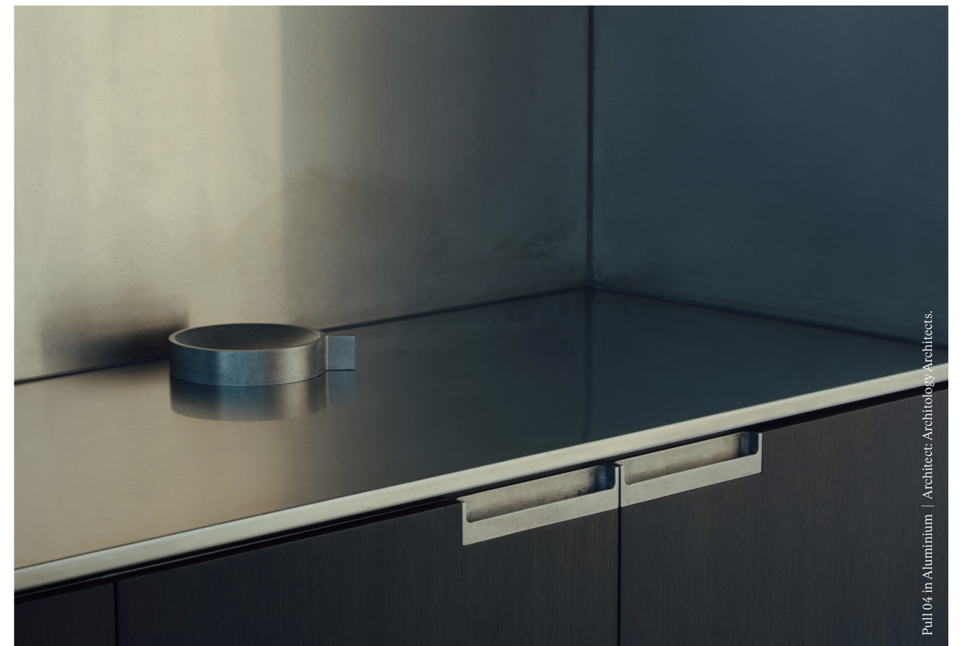
Pull 04 in Aluminium | Architect: Architology Architects.