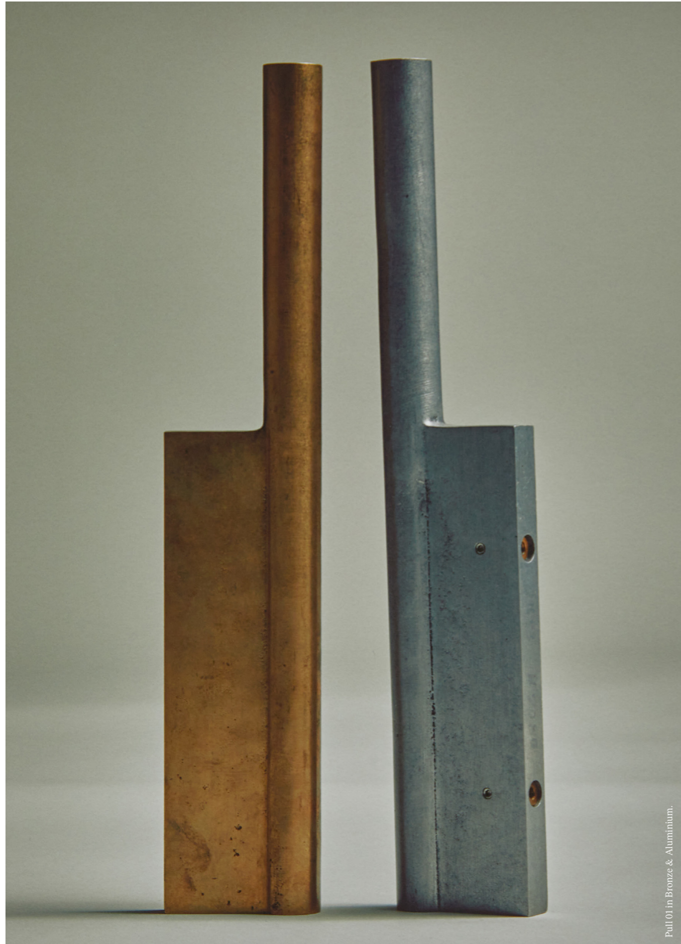
Pull 01 in Bronze &amp; Aluminium.