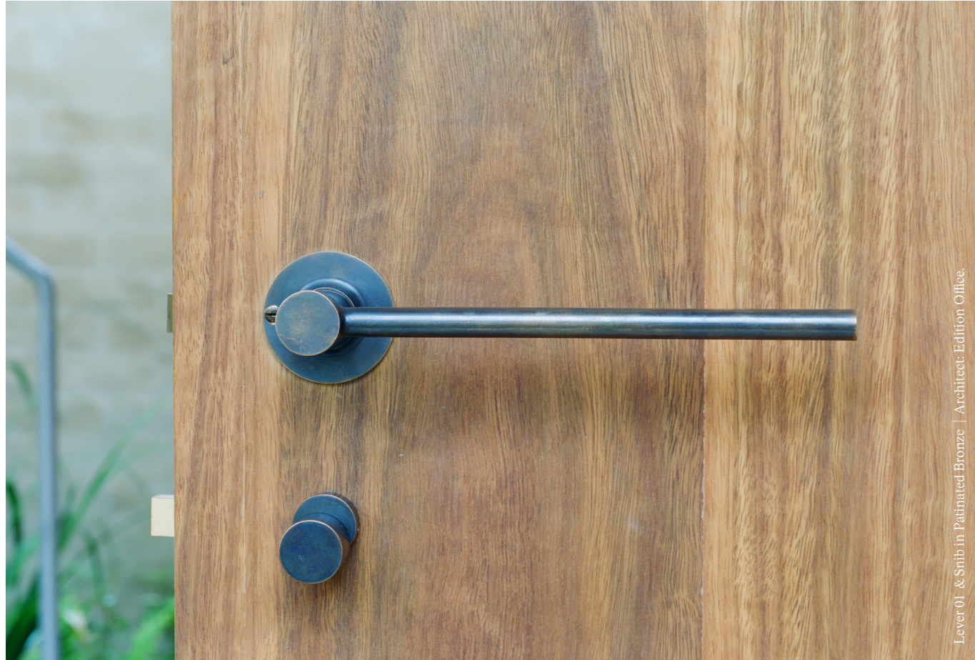
Lever 01 & Snib in Patinated Bronze | Architect: Edition Office.