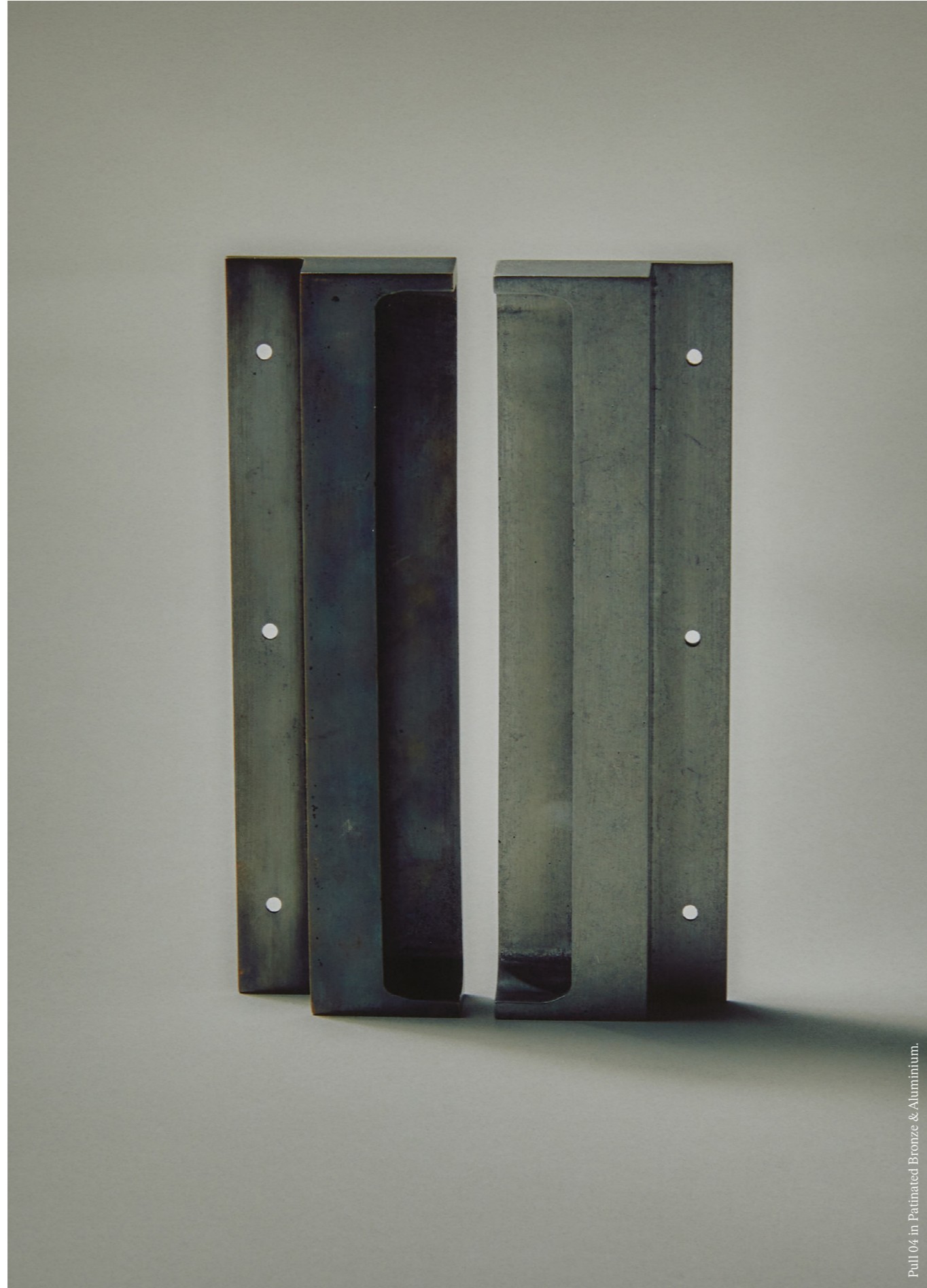
Pull 04 in Patinated Bronze &amp; Aluminium.