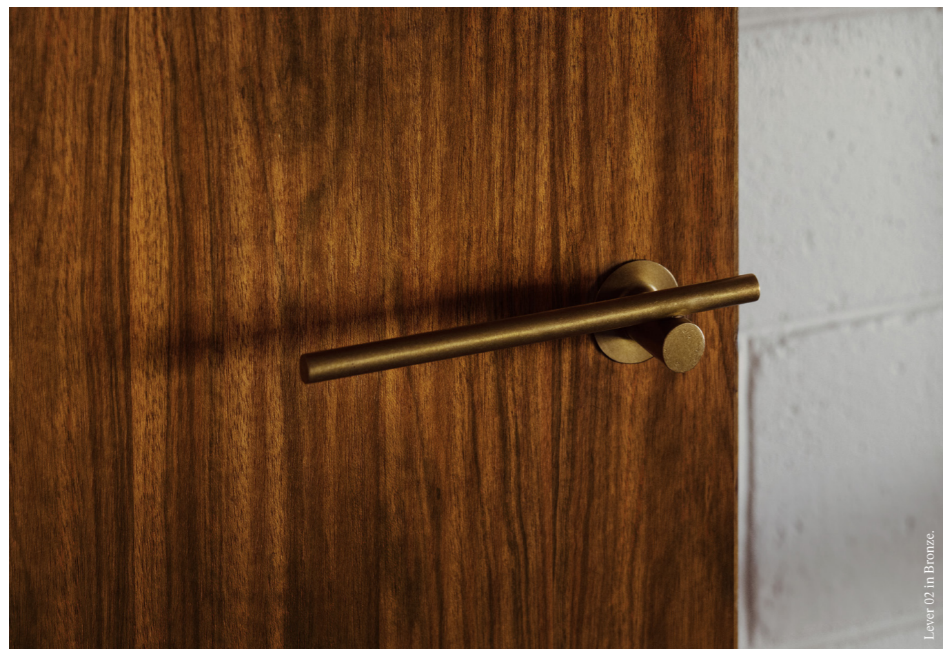
Lever 02 in Bronze.